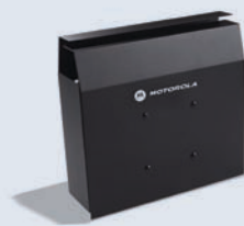
Heavy Weather Kit KT-5181-HW-01R