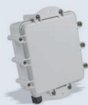
48V Transformer and Power Surge Protector AP-PSBIAS-5181-01R

Not Shown: Wall Pole and Mounting Kit (KT-5181-WP-01R) and Outdoor Antennas