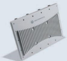
AP 5181 Dual Radio AP AP 5181-13040-WWR